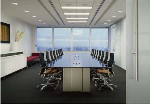
Conference Board room with hidden audio visual systems and black out blinds.