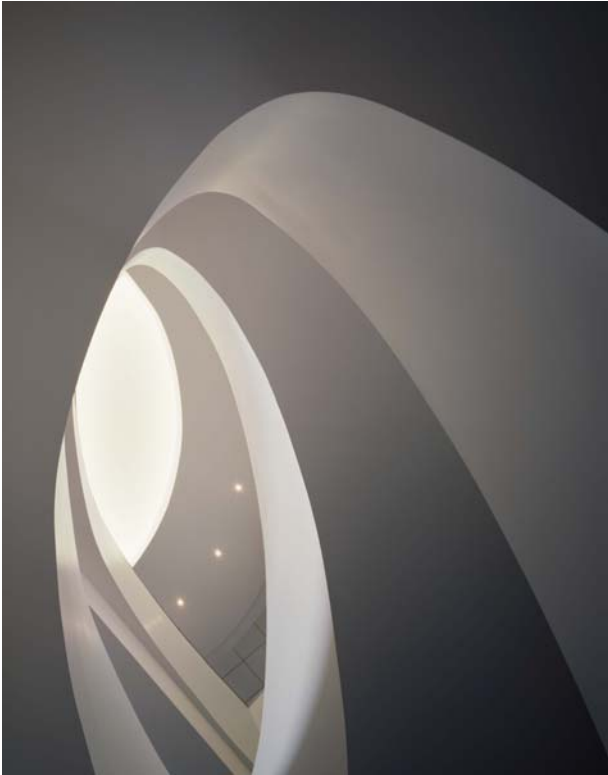
View looking up the stairs into an internal light.