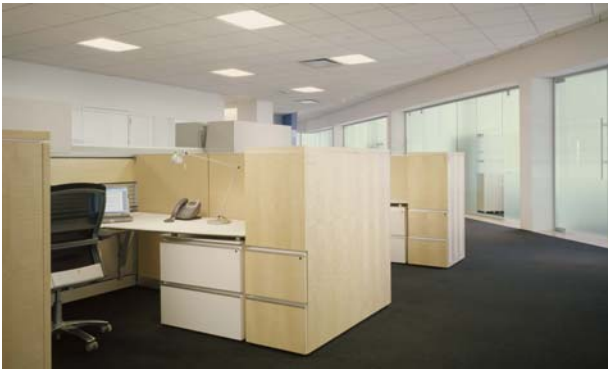
Reduced height workstations allow maximum ingress of daylight into the space.