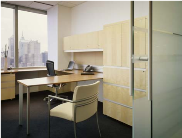
A typical office – there is no hierarchy between the kind of furniture used.