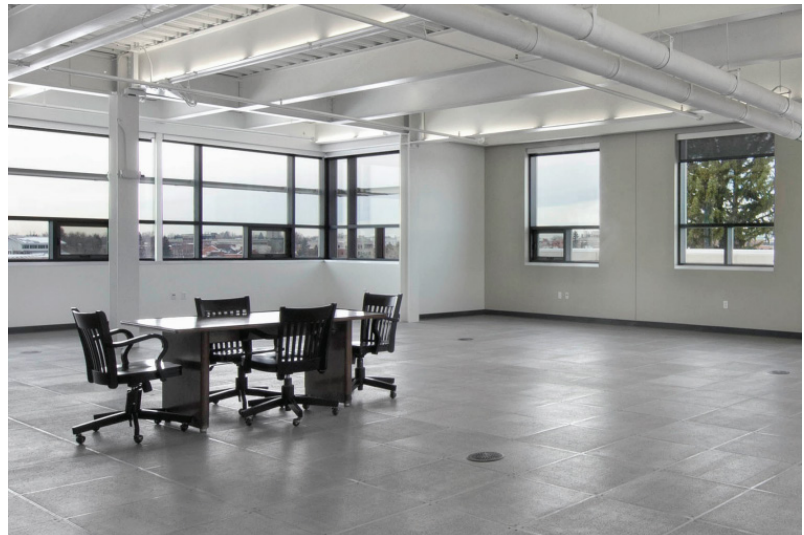
Underfloor air distribution systems support radiant conditioned spaces.

The radiant system was designed to function without a chiller. Cold water is instead supplied by a cooling tower that provides evaporatively cooled water to the system. Hot water for the radiant system is provided by a natural gas condensing boiler system using variable speed pumps. Underfloor air distribution systems provide ventilation for the radiant conditioned spaces.