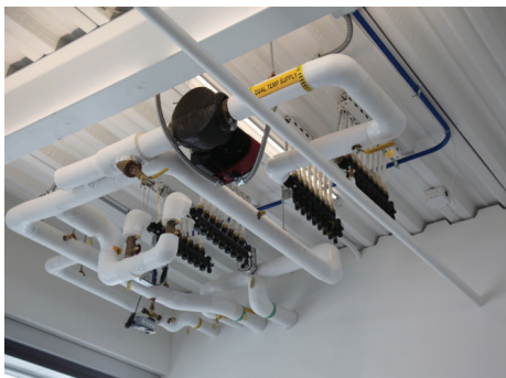
Radiant heating or cooling tubing.